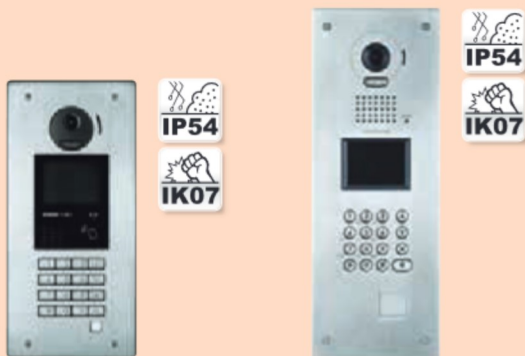
GT-DMB-N Available 3rd Quarter 2017 W/NFC reader (Back box not included.) Use GF-3B.