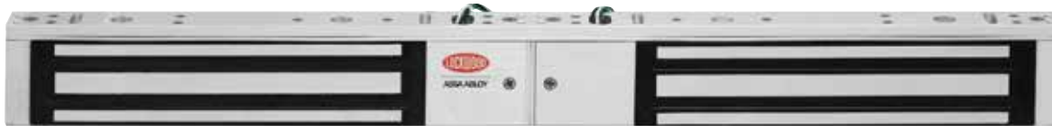
Z8 Double Electromagnetic Lock - Non Monitored