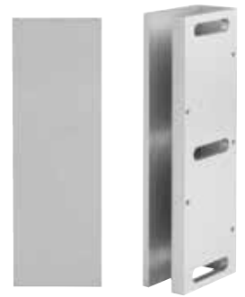
Glass Door "U" Bracket

The Lockwood Padde Series Electromagnetic Lock range offers a number of accessory options. These accessories allow the electromagnetic locks to be used in a number of different applications and can be adjusted and suited to each situation. This allows the installer to configure the door as required allowing user specific features such as open in / open out selection or glass door applications. Lockwood's Electromagnetic Lock accessories meet or exceed local and international standards, providing safe and secure locking.