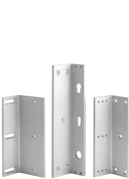
L and Z Brackets