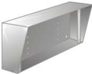
external stainless steel enclosure