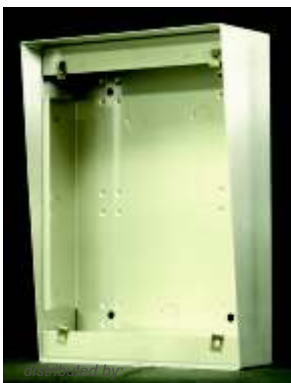
stainless steel CST enclosure model: ENCCSTSS height: 330.0mm width: 240.0mm depth: 130.0mm

designed specifically for our CST range of telephones to allow easy surface mounting.