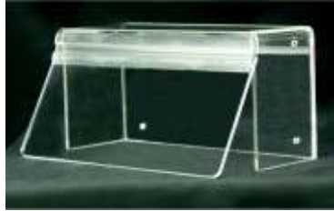
acrylic weather-shield enclosure model: ENCDSACH height: 150.0mm width: 298.0mm depth: 110.0mm