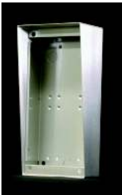
stainless steel enclosure model: ENCDSSSV height: 275.0mm width: 133.0mm depth: 85.0mm