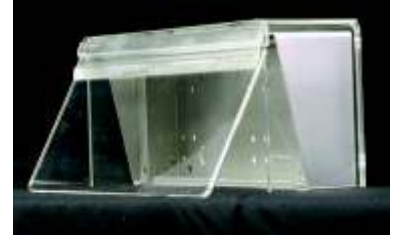
a stainless steel enclosure mounted inside an acrylic weather-shield