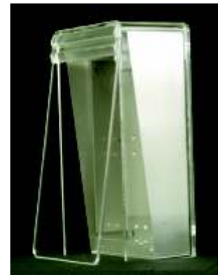
a stainless steel enclosure mounted inside an acrylic weather-shield