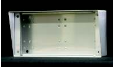
stainless steel enclosure model: ENCDSSSH height: 133.0mm width: 275.0mm depth: 85.0mm