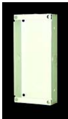
steel flush-mount wall box horizontal or vertical model: ENCDSWB height: 262.0mm width: 122.0mm depth: 47.0mm

designed to suit the recessed Sentry and Sentinel products, it is mounted into a hard cavity and fixed in place so that the telephone unit can then be mounted to it.