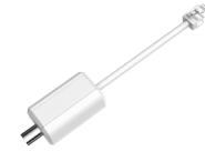
LR1002 ePoE Over Coax Converter