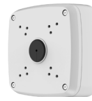
PFA121 Junction Box