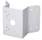
PFA151 Corner Mount