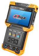
PFM900-E Integrated Mount Tester