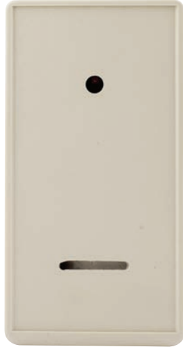
GLT43308NL For Customised Keypads