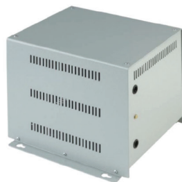
EN3-4050 EN3-6070 EN3-80 EN3-80-2 EN3-100 EN3-150