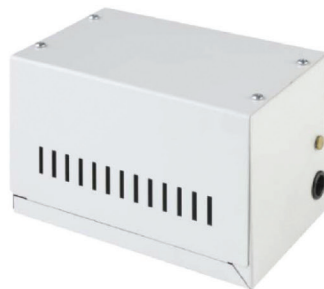
EN1038 EN1-44 EN1-50