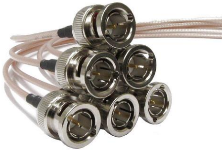
BNC Male Patch Lead 400mm RG179 Cable P/N: E30130141/RG179