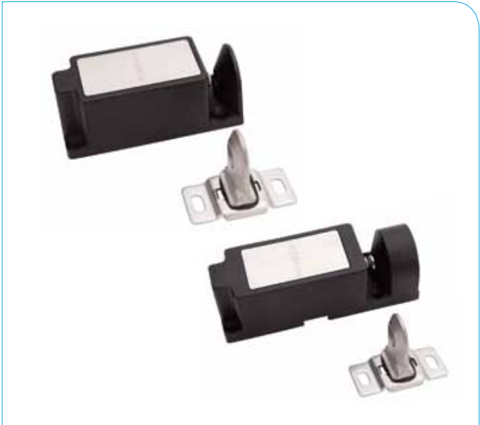
FCL0001 & FCL0002