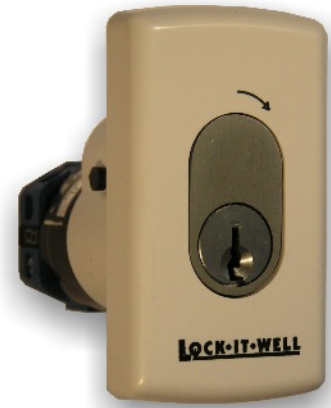
The Example shown is for a O-Series Lockwood 570, Switch mount, with Spring Return one way with a Multi-Voltage Contacts