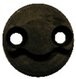
Cylinder Cam LIW Code "PO05"

Fixed or Lazy? Fixed cam's allow the key to be removed in the 12 O'clock position only. Lazy cam's allow the key to be removed in any position. However the key way will always point to 12 O'clock to allow removal.