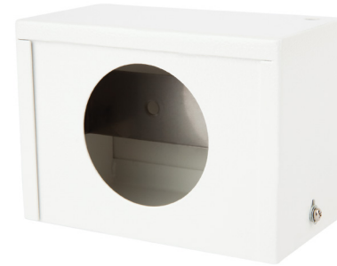
35772 FLOOR MOUNT BOX

The LOX 35770+35771 Heavy duty door magnetic holder, with 50kg holding force, titanium alloy surface finished, elegant appearance. When an alarm occurs, power is removed from the devices and the doors are returned to the closed condition. The devices come in 12 or 24VDC .