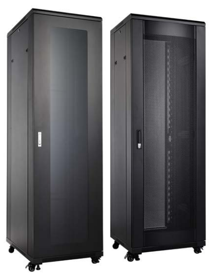
glass door mesh door

All floor racks come fully assembled and include leveling feet, heavy duty castors, shelves, ceiling mounted fan units with thermostat, a PDU and nuts/bolts/washers. All of the Garland floor racks come complete with reversible/lockable doors, removable and lockable side panels, top panel with ventilation holes and four cable entry points, bottom panel with two cable entry points, adjustable rails and have a 1000kg static load limit. A complete range of accessories is available for this these products.