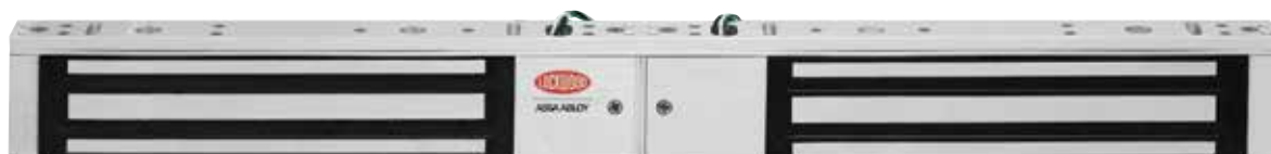
Z8 Double Electromagnetic Lock - Non Monitored