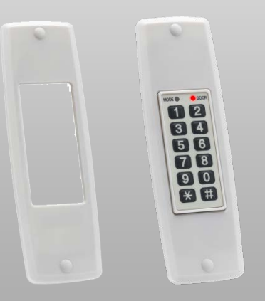
MP-C02 – Flush-Mount Housing for C-Type Keypads