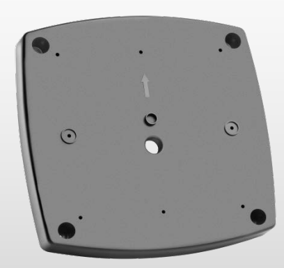
MP-Z01 – Mount Spacer for AY-Z12A