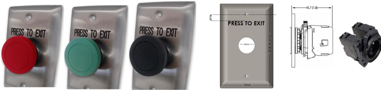
Mushroom Operators (40 mm and 60 mm)