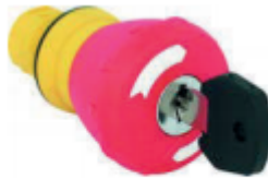
40 mm Key Release Mushroom Cat. No. 800FP-MK44