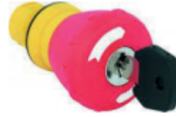
40 mm Key Release Mushroom Cat. No. 800FP-MK44