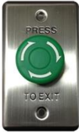
70mm x 115mm