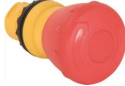
Twist-to-release Operators 40 mm,